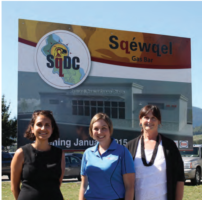
Funders; TACC, the Bank of Montreal, First Nation Trust

The event had a nice turnout with a variety of attendees including Elders, staff, community members, press and more. At the conclusion of the ceremony there was snacks and refreshments served in the shade of a couple tents.