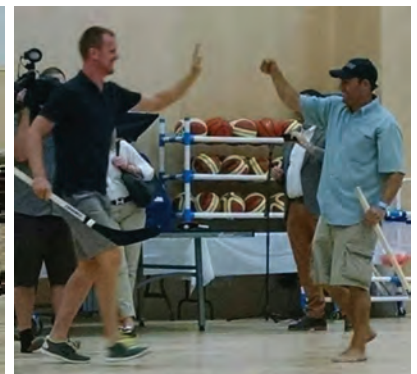
After they Scored