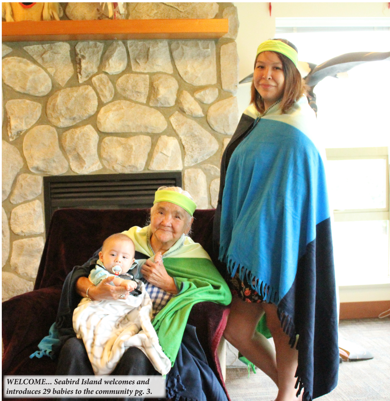
WELCOME... Seabird Island welcomes and introduces 29 babies to the community pg. 3.