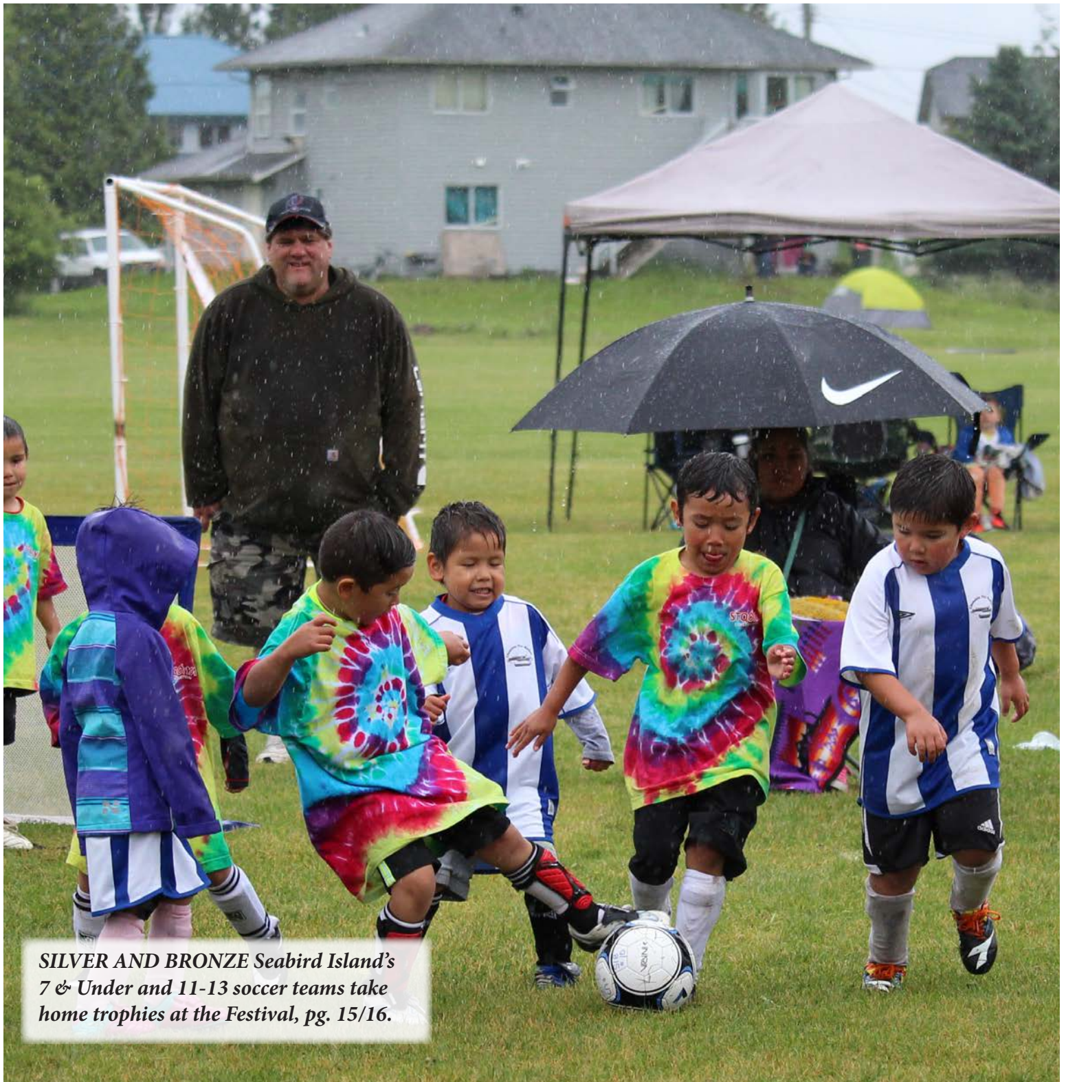
SILVER AND BRONZE Seabird Island's 7 & Under and 11-13 soccer teams take home trophies at the Festival, pg. 15/16.