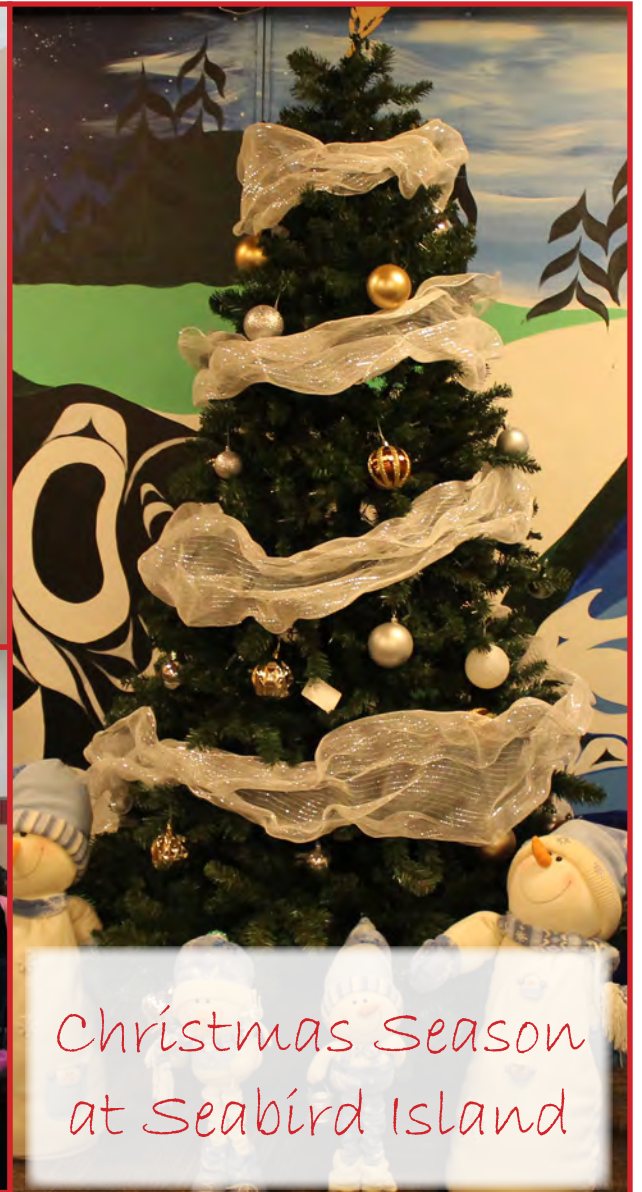
Christmas Season at Seabird Island