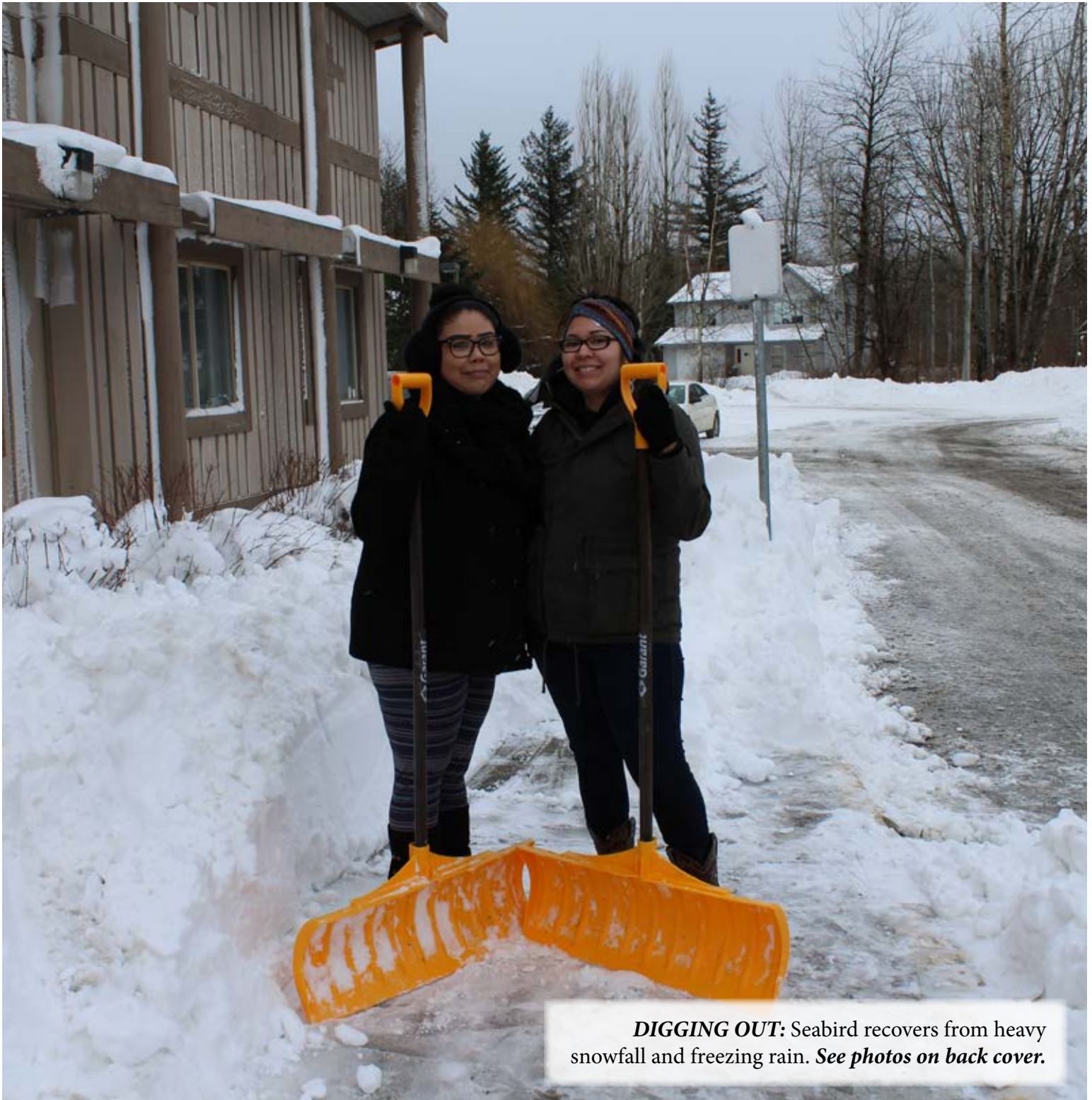
DIGGING OUT: Seabird recovers from heavy snowfall and freezing rain. See photos on back cover.