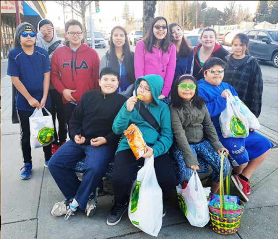
Youth took part in our February outing to the Escape Rooms in Abbotsford. We had 45 minutes to get out of a puzzle room as part of our group! After the Escape Room, Youth were taken for dinner. There were 25 Youth that came and everyone enjoyed the trip.