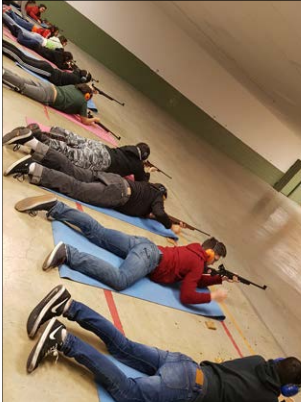
Rifle Shooting, which began in December, came to a close this month with Youth participating in our last session. Rifle Shooting was part of the Youth Fitness program.

It was a great experience for all the youth!