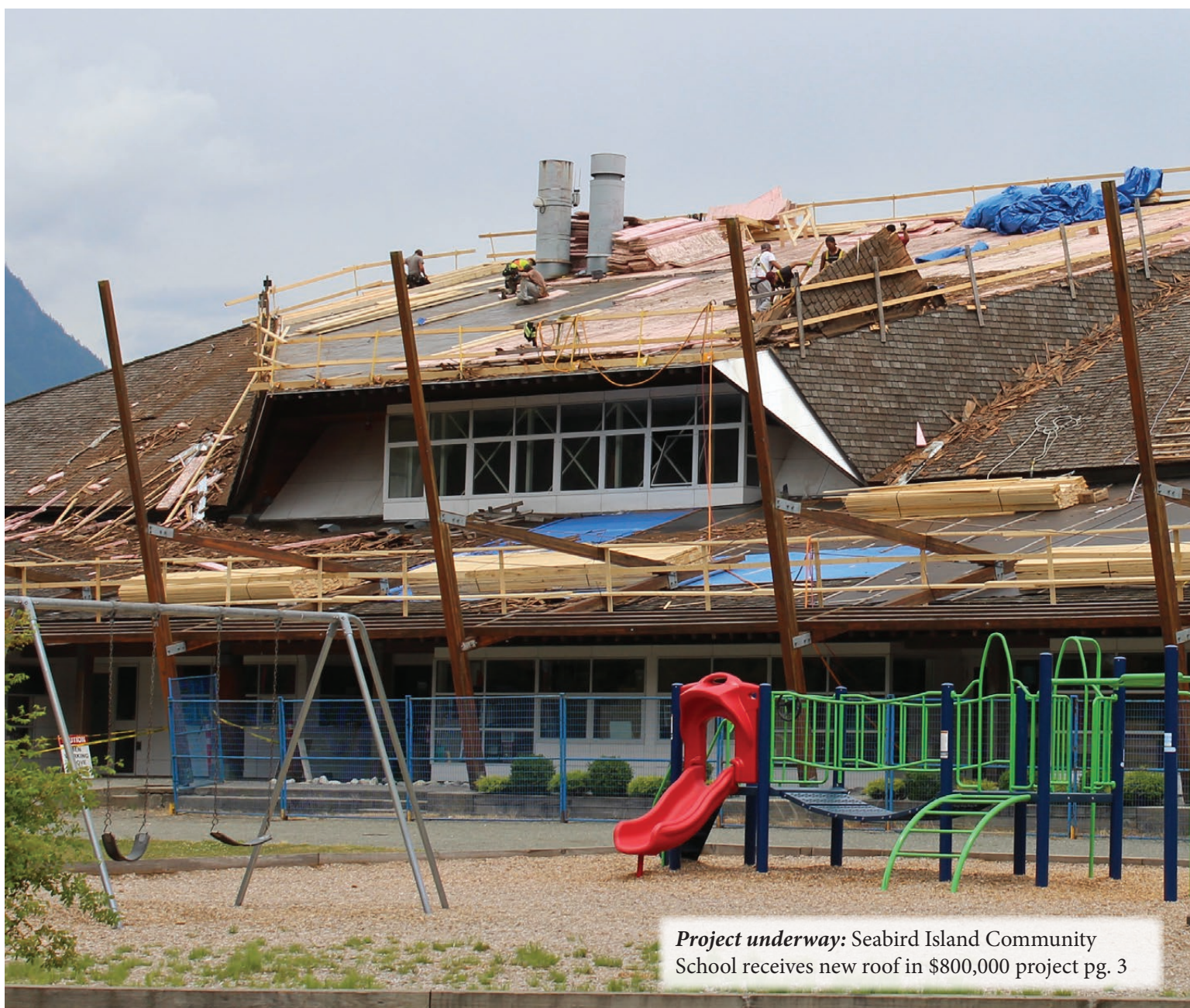
Project underway: Seabird Island Community School receives new roof in $800,000 project pg. 3