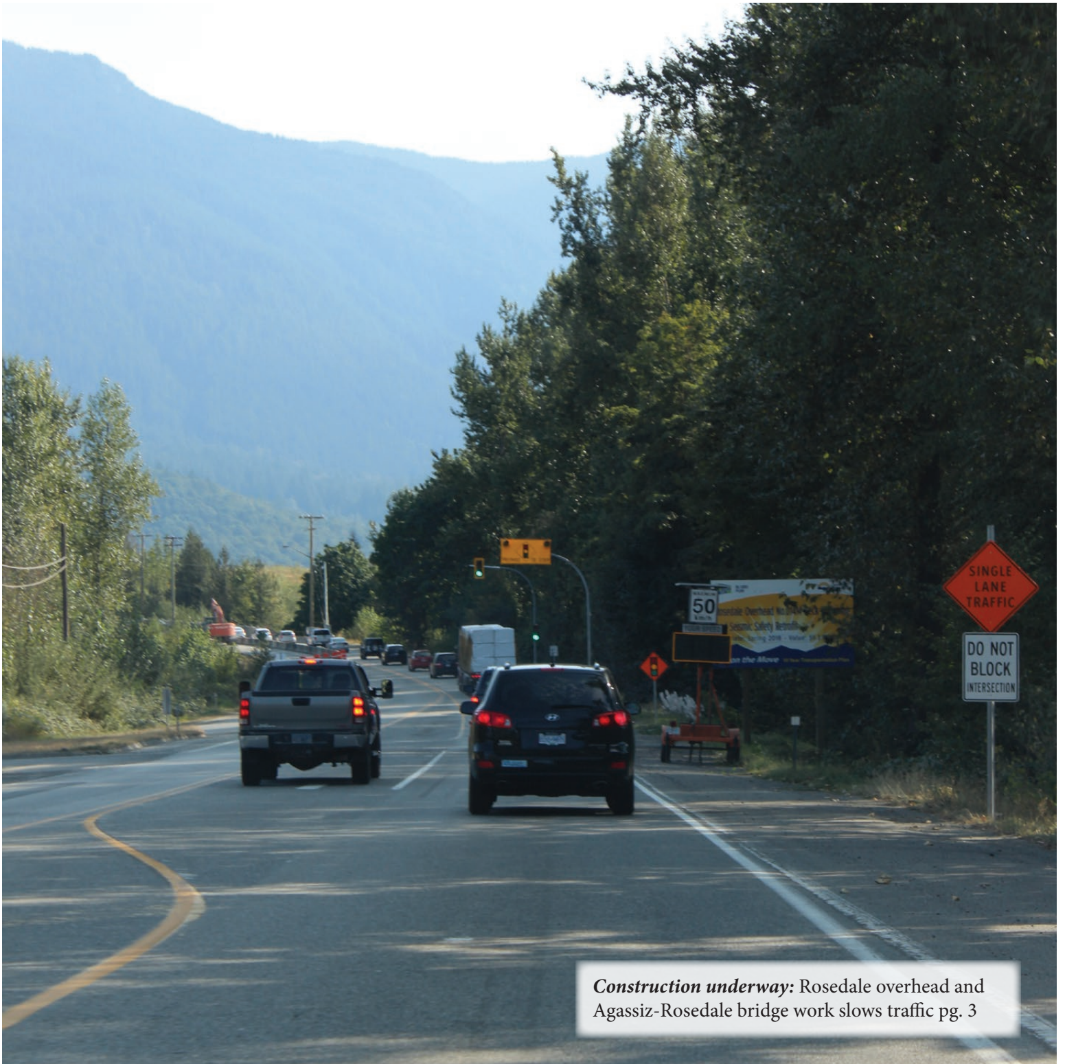
Construction underway: Rosedale overhead and Agassiz-Rosedale bridge work slows traffic pg. 3