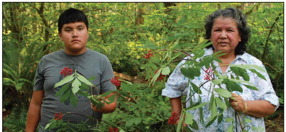
Harvesting with Tilly: Group takes a trip to Chilliwack Lake to gather a variety of medicinal plants, including Devils Club, which will be turned into medicine.