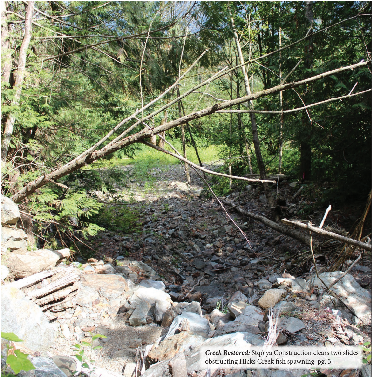
Creek Restored: Stqó:ya Construction clears two slides obstructing Hicks Creek fish spawning pg. 3