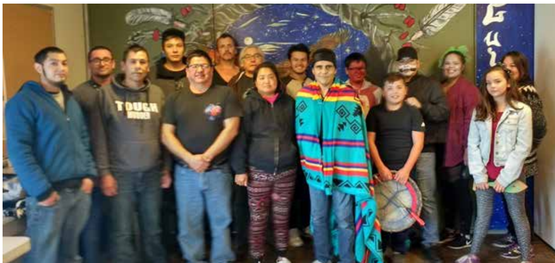
Picture includes Case Manager, Men from the home, support staff and students of Seabird Island Community school.