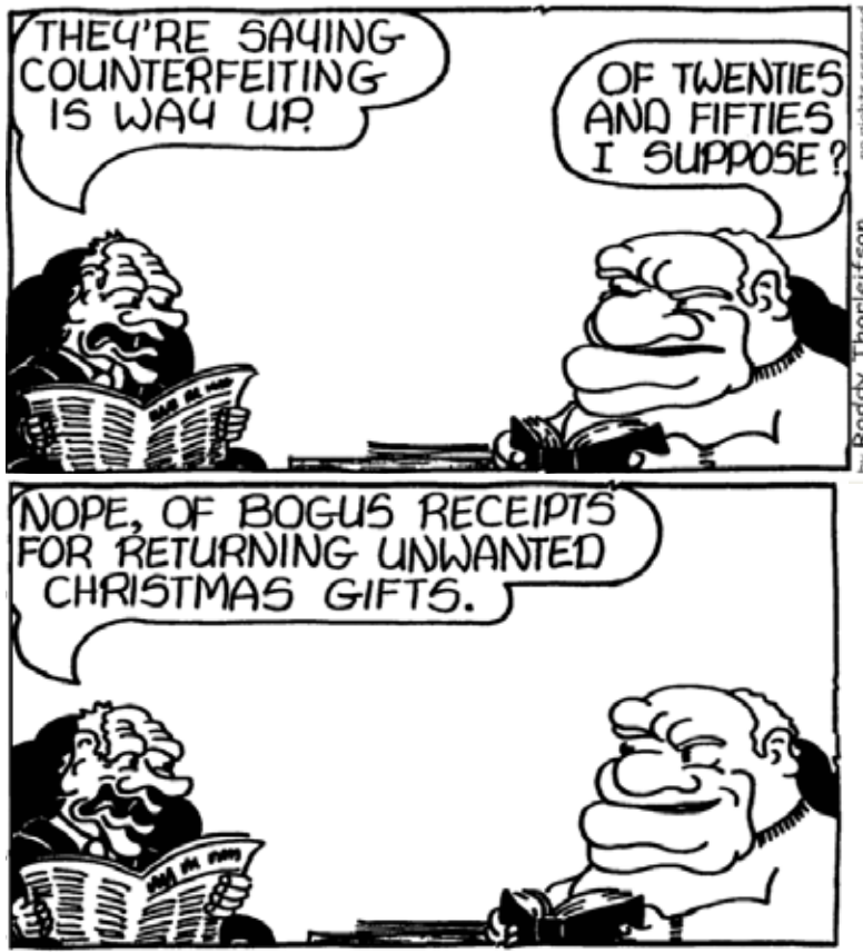
by Roddy Thorliffson no rights reserved https://mooselakecartoons.com