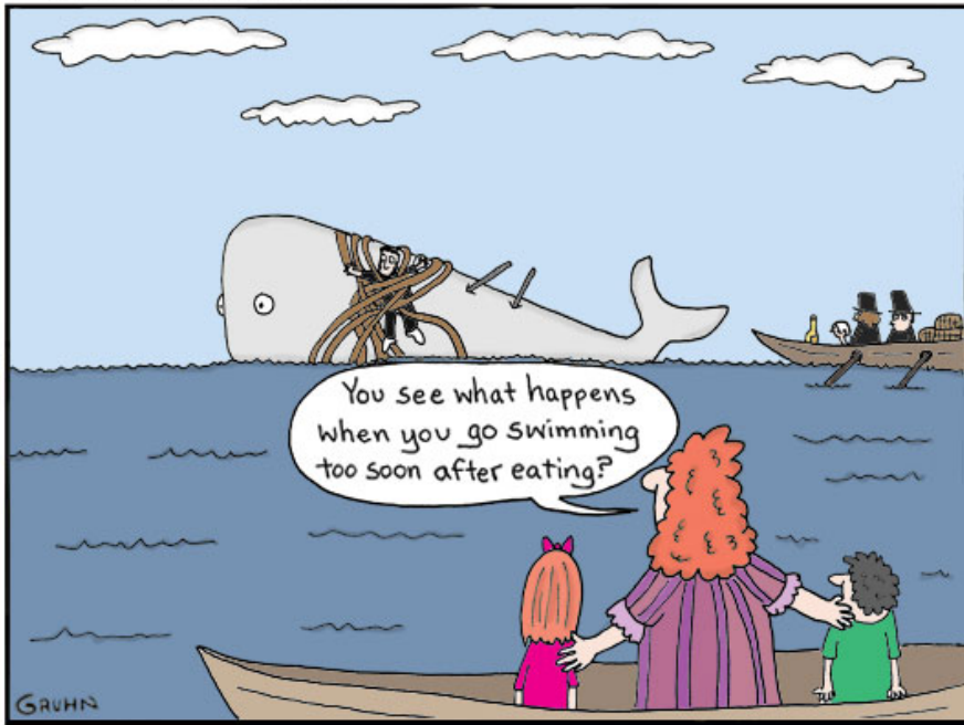
Moby Dick - A teaching moment.