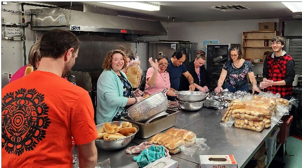
LOTS of Hot Dogs to wrap!

and make themselves comfortable while watching this fun family movie. Thank you to all the people that volunteered their time to make this night a success. The school is planning to host an outdoor movie evening in June, so plan on joining us! In the meantime, please enjoy some of the pictures that were taken of the evening.