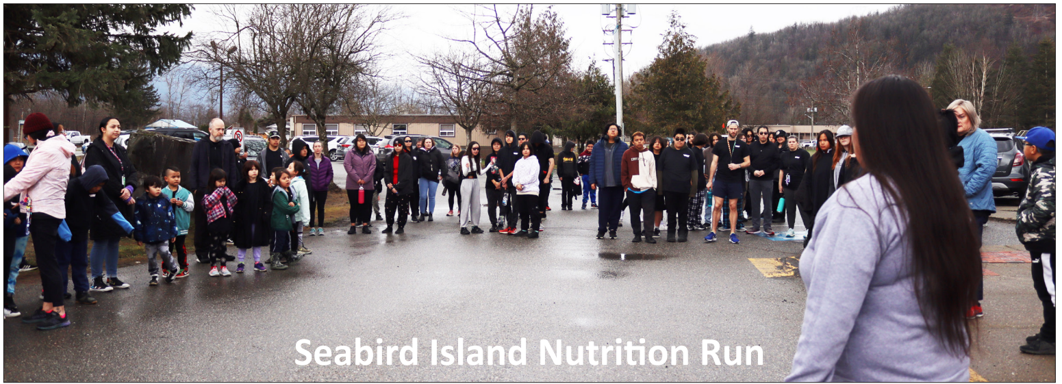
Seabird Island Nutrition Run