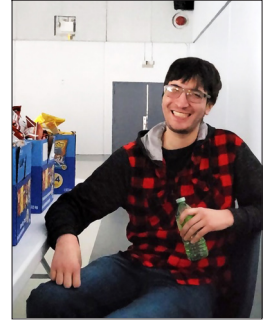
Giving out Snacks!