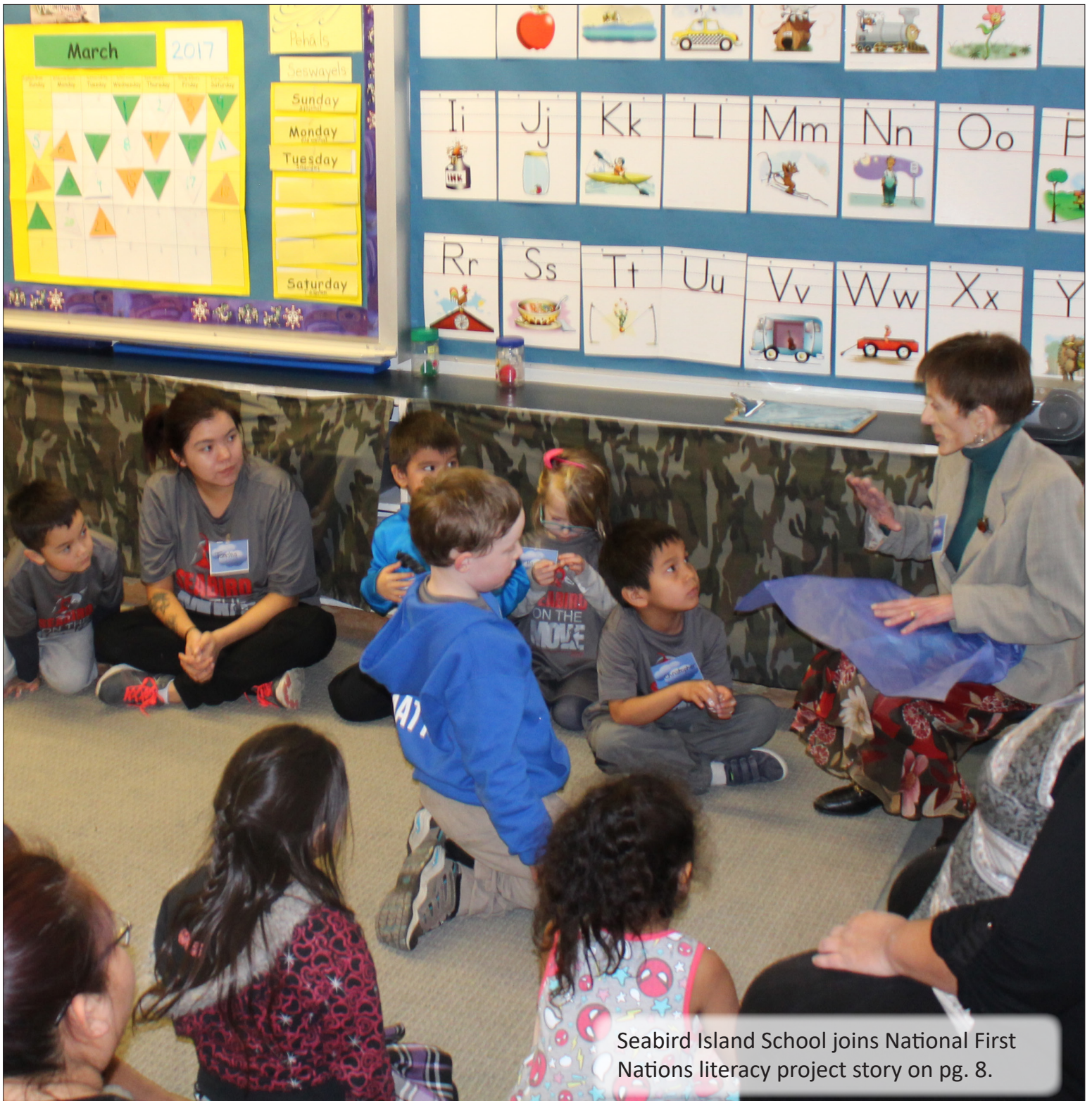
Seabird Island School joins National First Nations literacy project story on pg. 8.