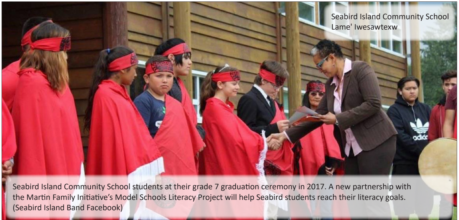
Seabird Island Community School students at their grade 7 graduation ceremony in 2017. A new partnership with the Martin Family Initiative's Model Schools Literacy Project will help Seabird students reach their literacy goals.