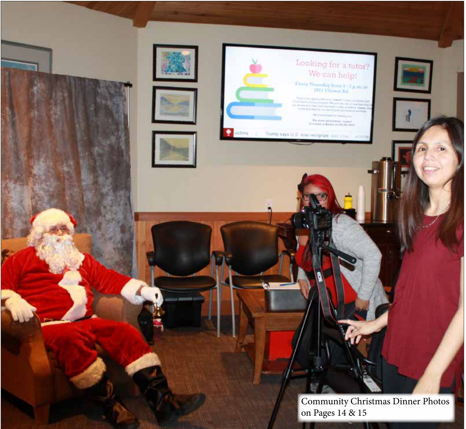
Community Christmas Dinner Photos on Pages 14 & 15

Pick up your Santa photos at Hamper Day December 18 th