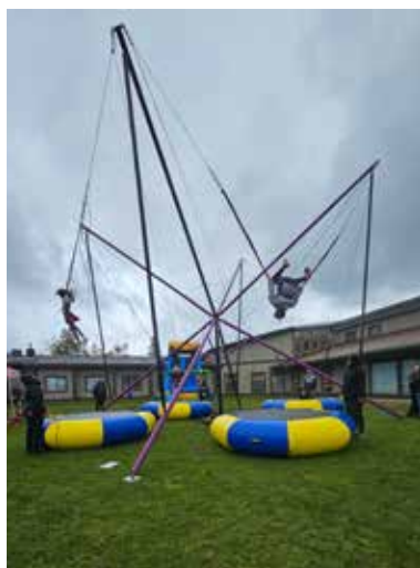
Rain or shine, the Euro Bungee was the top attraction at the Sqéwqel Kids Wonder World.