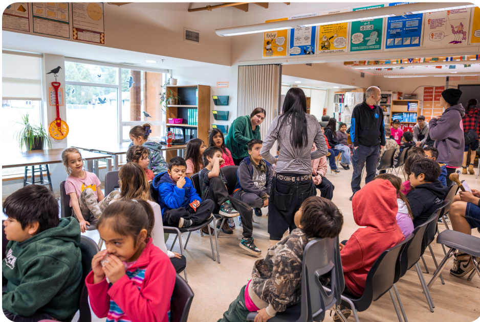
Slahal tournament with Sts'ailes Community School

The tournament also fell on Pink Shirt Day, making the gathering even more meaningful. Spreading kindness not just within our walls, but with another school, was a powerful reminder of what we can build together.