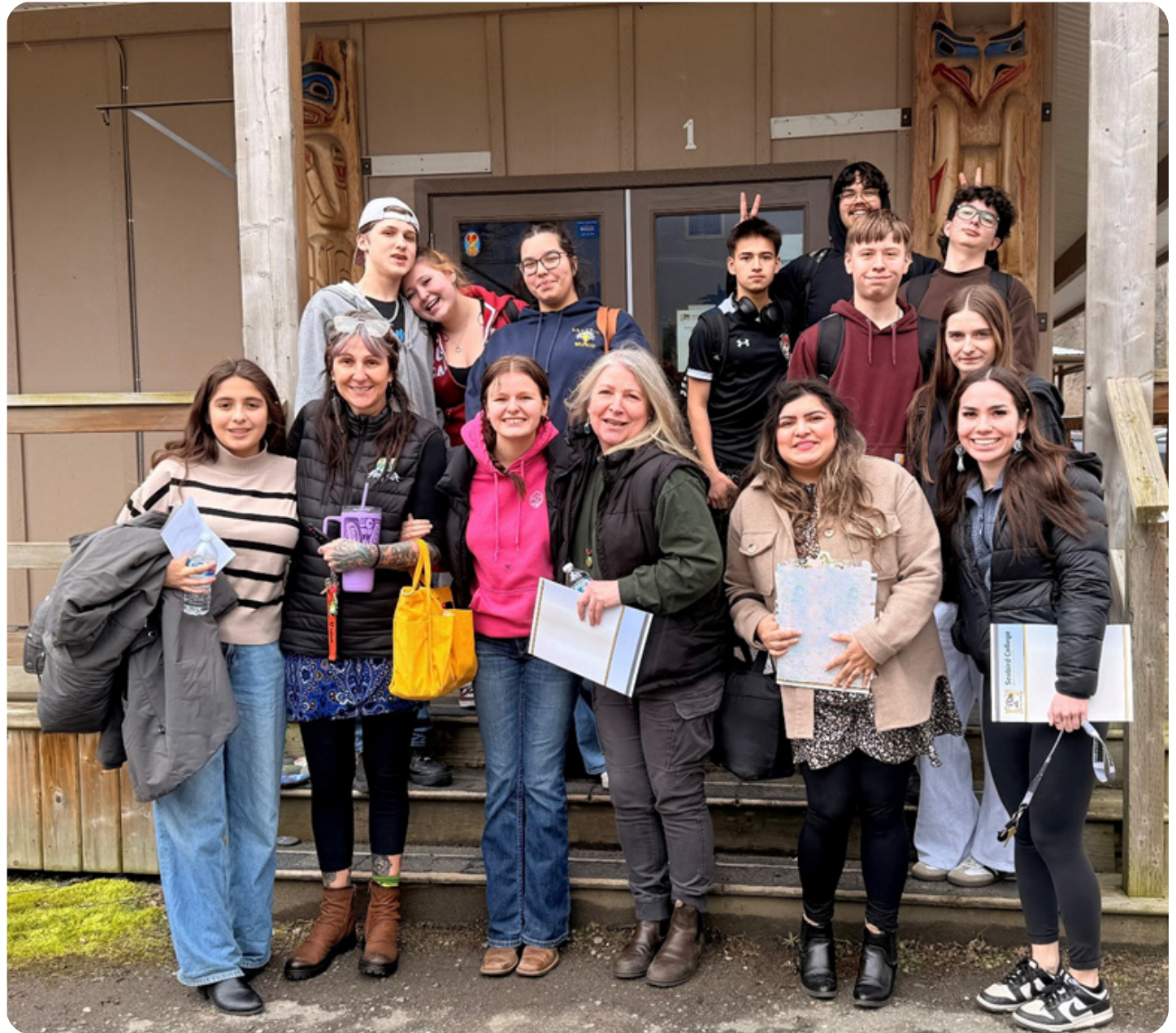
AESS Tour of Seabird College

On February 27, Grade 10-12 students from AESS — accompanied by four Indigenous Support Workers — toured campus and heard from both the College and Employment Services. Always great to get future students through the door.