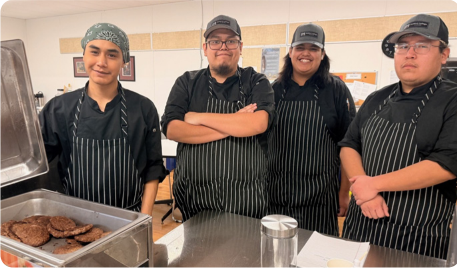
Culinary Students Making Burgers for lunch