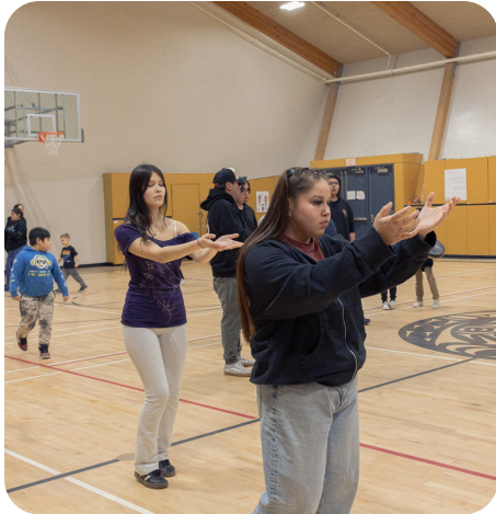
Traditional Stó:lō dancing.

These past two months have brought some of the most vibrant land-based learning of the year so far — and a few unexpected leaders have stepped up along the way.