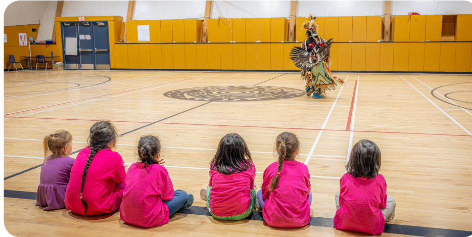
Powwow dancing.

Students have been learning two distinct styles of traditional dance. A Stó:lō drum and dance group has been working with students all year, deepening songs and techniques that have spilled over beautifully into morning protocol. Students have also begun exploring Powwow-style dance — a style that differs from what many practice locally — with the spirit of cultural sharing and curiosity leading the way. Staff and students alike have embraced both with open hearts.