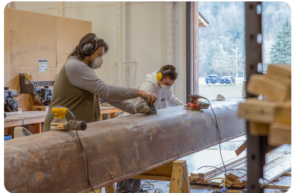
Student guided in canoe restoration

Students and staff have embarked on a long-term project to restore the canoe outside the high school — with a goal of having it on the water by late April or early May. Working alongside a local expert, students have been sanding and repairing the canoe piece by piece. This project is expected to continue through April, and we cannot wait to see it back where it belongs.