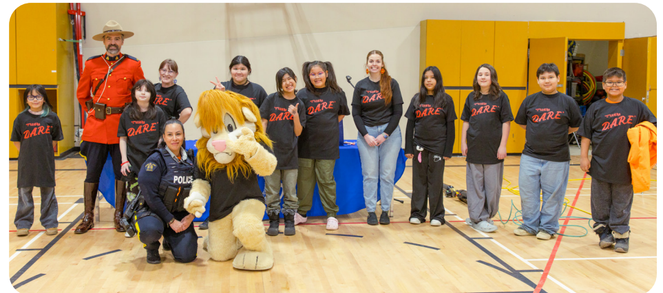
DARE graduation celebration