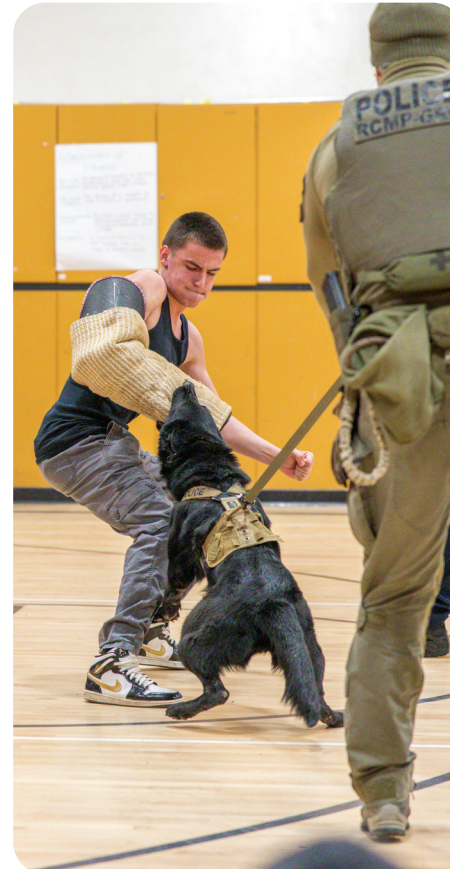
Student volunteer demonstrates police dog apprehension