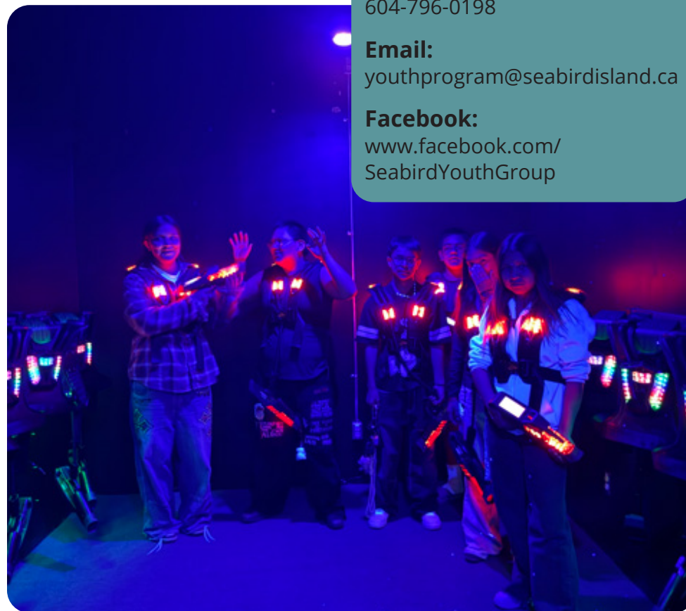
Youth at Central City Fun Park

where they created their own heart-shaped pizza. The youth enjoyed a fun outing to Central City Fun Park and the program hosted a Youth-Mentor badminton tournament partnered with the Indigenous Police Team.