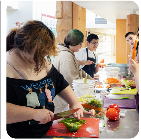
Students prepping lunch for land-based learning day.

Elder Yammo also joined us to share teachings about hides and history — a gift to staff and students alike.